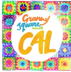
Square 13 - @knaoknits